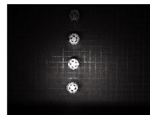
GL-HDB15028W-15-24 Battery Outer Inspection WD500mm