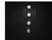
GL-HDB15028W-15-24 Battery Outer Inspection WD1300mm